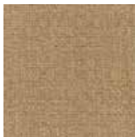
Linen Sesame 8318