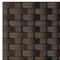
#11 Shimmer Russet